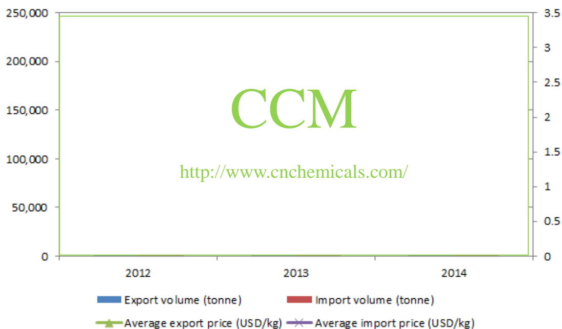
Figure 1.3.2-1 Import and export situation of melamine in China, 2012-2014